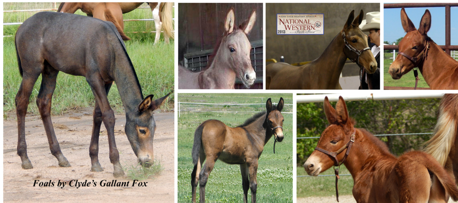
Foals by Clyde's Gallant Fox