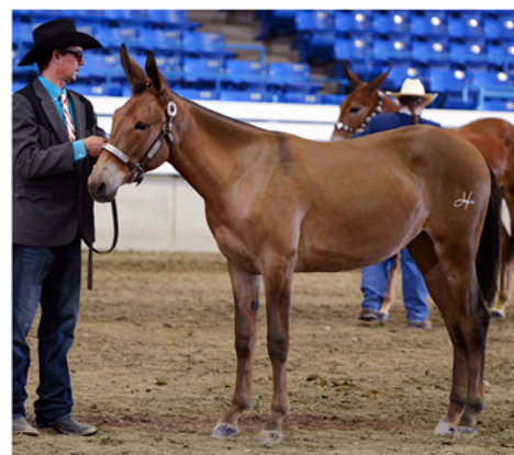
Pistols And Posies, 2012 Molly, World Champion 2 & Under Quarter Horse Type Bishop Mule Days